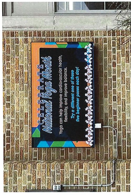
Install new EMC in same location